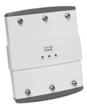
Figure 1. The Cisco Aironet 1250 Series Access Point

The platform was specifically engineered to support the power, throughput, and mechanical requirements of higher-speed WLAN technologies, including 802.11n. Currently, the platform provides both 2.4-GHz and 5-GHz modules compliant with the IEEE 802.11n draft 2.0 standard. As technology evolves, the platform is flexible to support future radio modules designed to deliver intelligent RF services, further enhancing the performance and reliability of the wireless network. The Cisco Aironet 1250 Series is a rugged indoor access point designed for both office and challenging RF environments such as factories, warehouses, hospitals and large retail establishments that require the antenna versatility associated with connectorized antennas, a rugged metal enclosure, and a broad operating temperature range. With a Gigabit Ethernet (10/100/1000) interface, the Cisco Aironet 1250 Series delivers line-rate throughput for higher-speed WLAN technologies such as 802.11n. The access point offers the flexibility of inline as well as local power options.