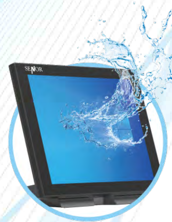
IP54 Whole Unit