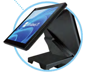
VFD / 10" / 15" Customer Display