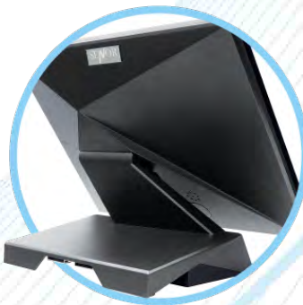
Aluminium Die-cast Sleek Enclosure