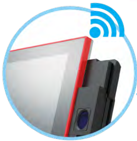
Wireless LAN & BT