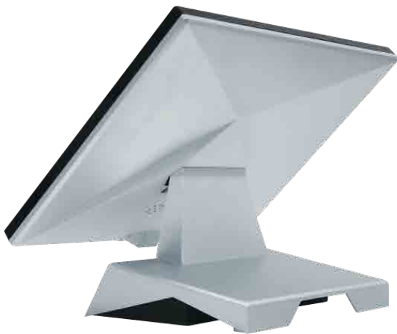
Silver colour is by order

v5POS is an energy-efficient solution with low power consumption on a high-performing platform. The CPU consumes less power, generates less heat and helps to keep our environment green.