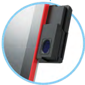
MSR / Fingerprint / RFID Reader