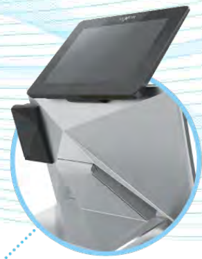
Upward Facing Display