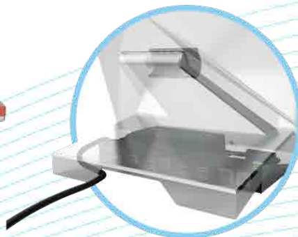
Internal Power Supply Cable Management System