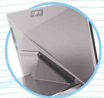
Fanless / Ventless / Screwless