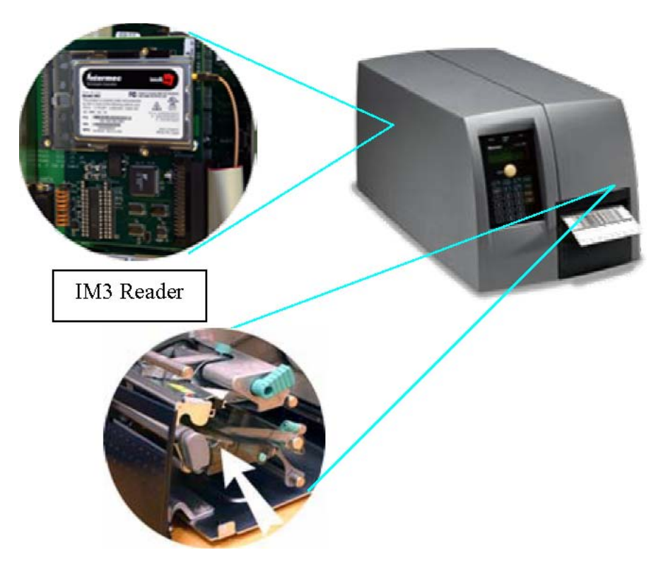
RFID Antenna ISO RFID Printer & Smart Labels

RFID field upgradeable kits are not available today but are coming. Intermec realizes the value of protecting customer investments. For this reason development is focused on providing field upgradeable kits for existing PM and PX series printers upon release of EPC UHF Generation 2 standards.